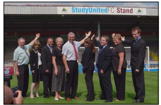
Delegates from North Lincolnshire Council, Scunthorpe United and Study United unveil the council's record breaking sponsorship of the Study United Stand