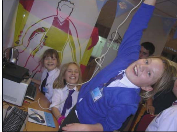
Children from St. Augustine Webster Catholic Primary involved in a highly interactive Science & ICT Data Monitoring session.